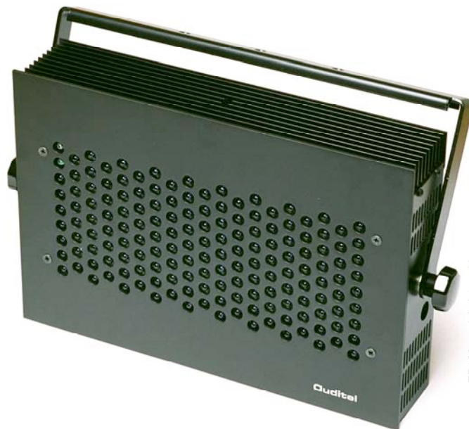
EP160 model pictured here